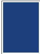
Quarter Page 3.5" wide x 4.875" high

Send print optimized pdf with all fonts and graphics imbedded. Files must be CMYK and 300 DPI or higher.